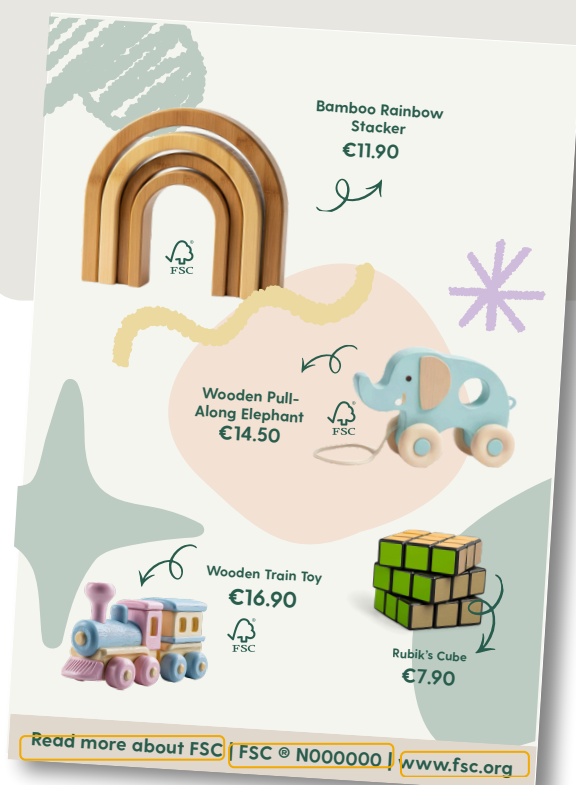
1. Promotional text 2. Licence code 3. Website

With any use of FSC trademarks, include: